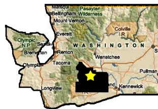
Yakima County, WA