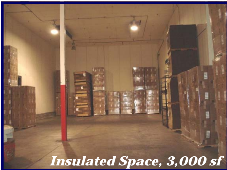
Insulated Space, 3,000 sf