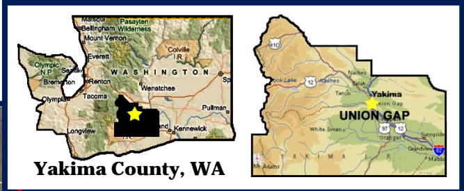
Yakima County, WA