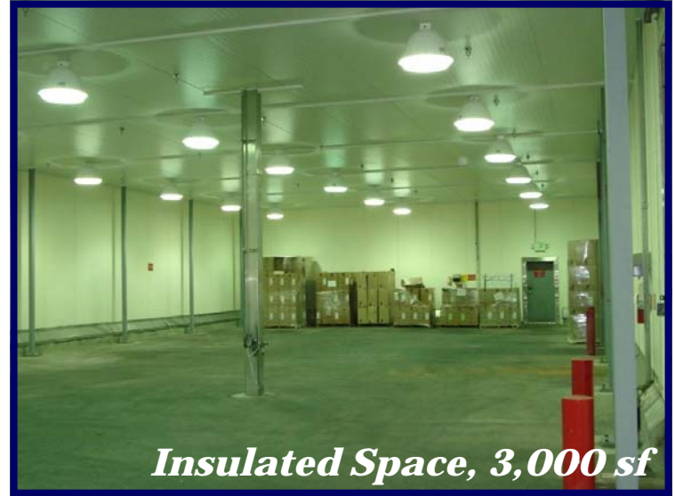
Insulated Space, 3,000 sf