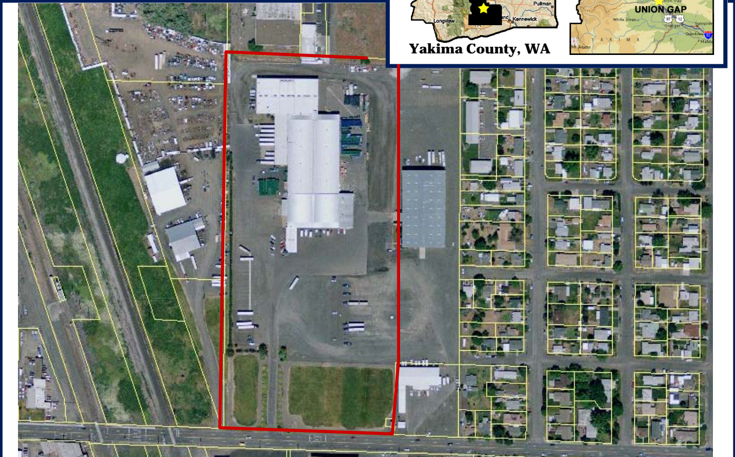
601 WEST AHTANUM RD, UNION GAP, WA