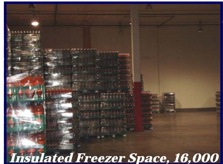
Insulated Freezer Space, 16,000