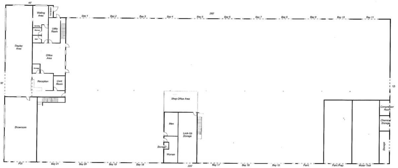
Main Level Showroom/Warehouse