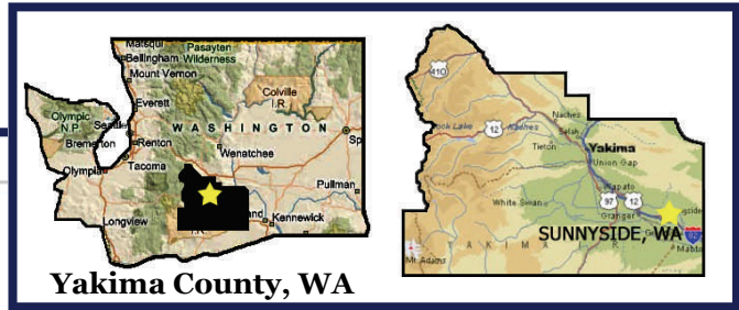
Yakima County, WA