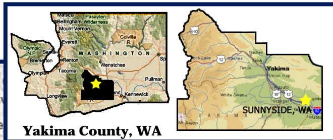
Yakima County, WA